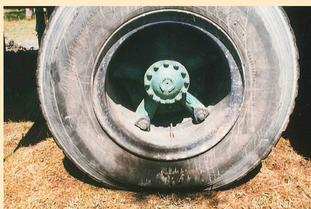
Concrete boom pump contact with overhead powerlines, result of electricity tracking through truck to earth.