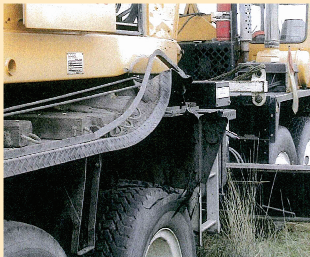
Crane contacted overhead powerlines resulting in tyre explosion and extensive damage to truck and crane.